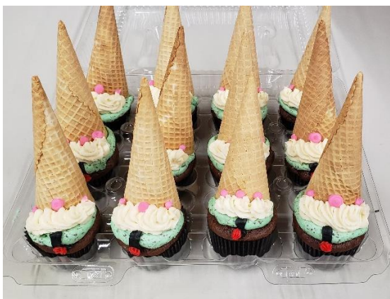
Cupcakes by Rachelle King