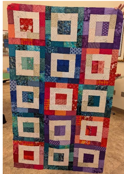
A finished top from a BOM raffle winner