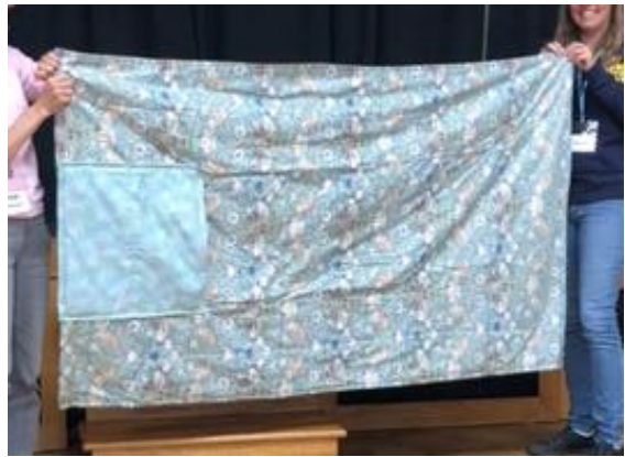
Quillow (Quilt + Pillow)