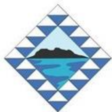
Ladies of the Lake Quilt Guild

The show is held at the Amador County Fairgrounds and features over 120 entries including stunning quilts and wearable art. We also have: an inspiration quilt, a silent auction, vendors, gift baskets, and a country store.