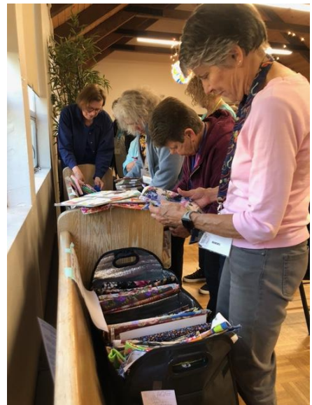
Browsing fabric donations