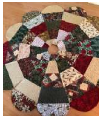
Christmas Tree Skirt September