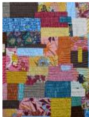
Kawandi Stitching August