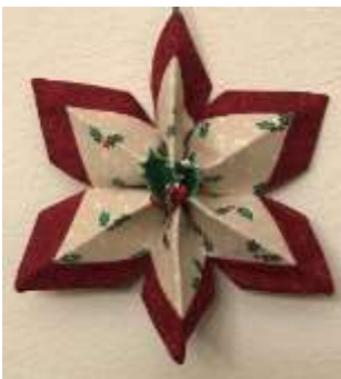
Fabric Star July