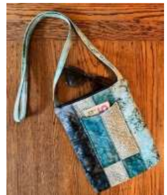
Jelly Roll Cross-Body Bag October