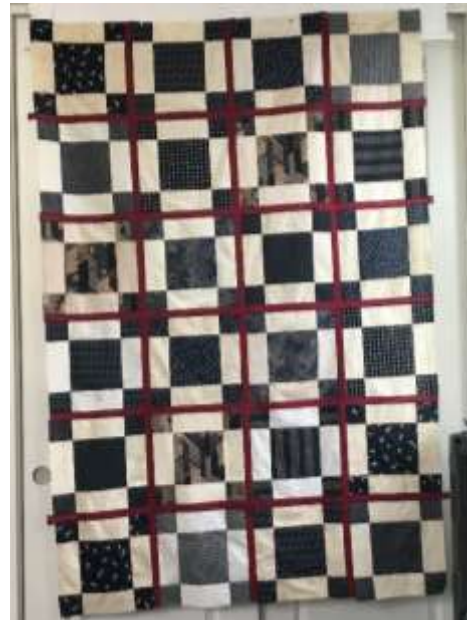
Lap quilt for hubby