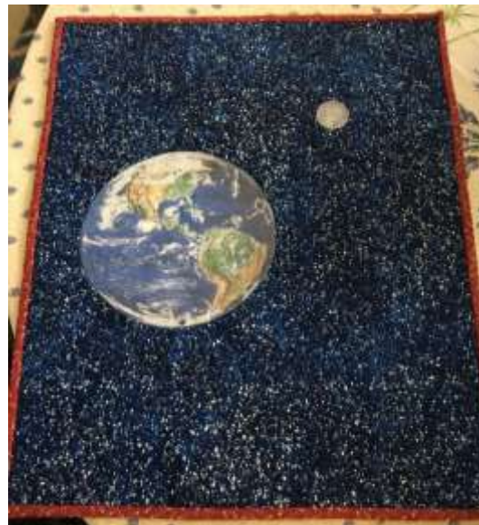
For my grandson who's into space. His favorite planet is earth.