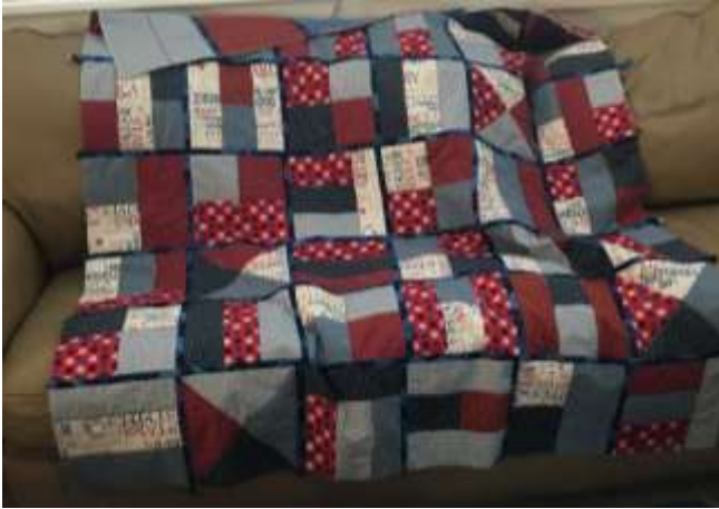
Patriotic quilt for hospice