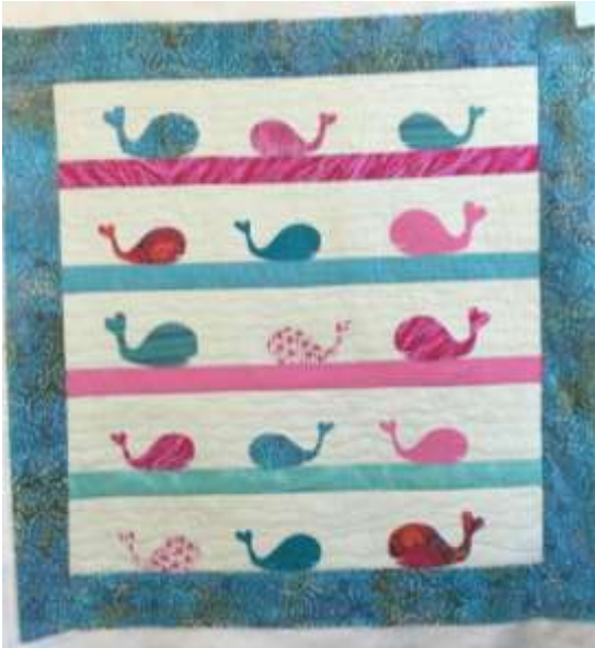
New great niece in Hawaii