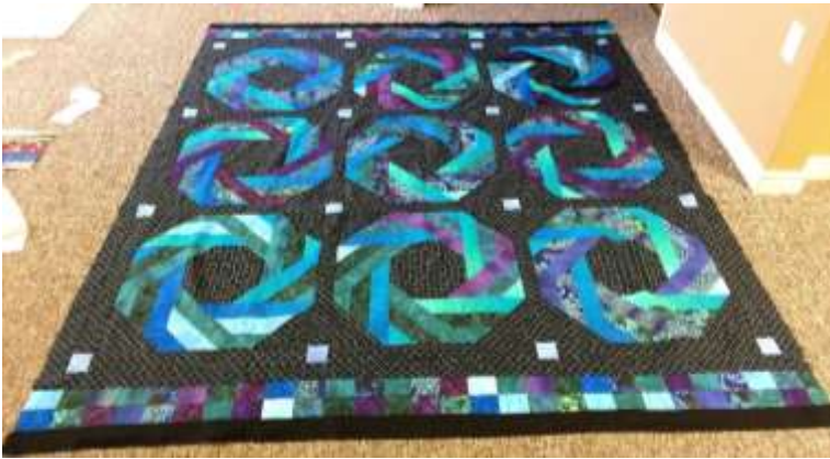
One of my favorite quilts - because it's unique.